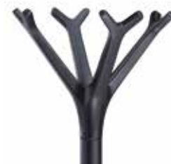
1698-N Matt black