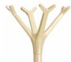
1698-AV Light ivory (RAL 1015)