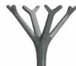
1698-GY Traffic grey (RAL 7043)