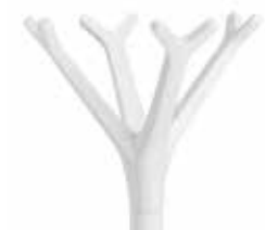
1698-BO Matt white