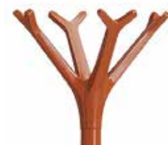
1698-MR Copper brown (RAL 8004)