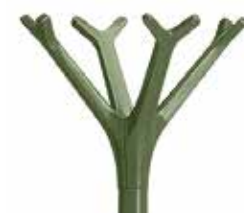
1698-VR Reseda green (RAL 6011)