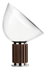
Table lamp providing indirect and reflected light. Reflector in painted aluminium, gloss white on the outside and matt white on the inside. Directionable diffuser in transparent PMMA. Body in matt black or naturally anodized extruded aluminium. Base in nickel-plated metal. Electric cable of useful length 220 cm, with dimmer switch for ON/OFF and adjustment of the light flow between 10-100%. Plug-in power supply with interchangeable plugs.

Designed by Achille and Pier Giacomo Castiglioni