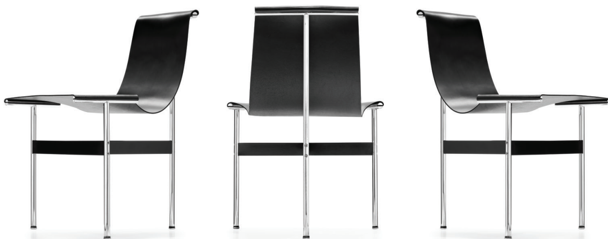
Chromed steel rod frame, saddle leather.