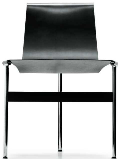
Chromed steel rod frame, saddle leather.