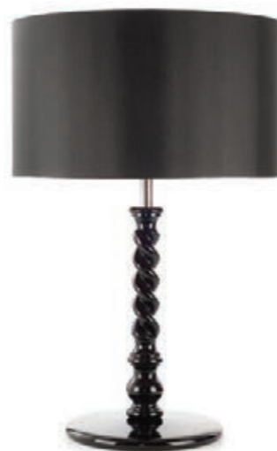
small table lamp