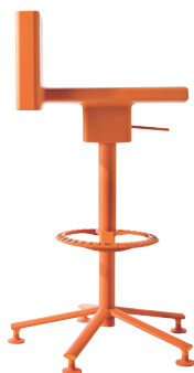
Matt colour Orange 1658 C