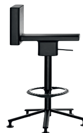
Matt colour Black 1764 C

Foot rest static load test EN 1728:2000, L3 - severe Seat and back static load test EN 1728:2000, level 3 severe Seat front edge durability test EN 15373:2007, L3 - severe Arm fatigue test EN 15373:2007, L3 - severe Seat and back fatigue test EN 15373:2007, L3 - severe Seat and back fatigue test EN 15373:2007, L3 - severe Non-domestic seating. Vertical load on back rest EN 15373:2007, L3 - severe Non-domestic seating. Safety requirements EN 15373:2007, level 3 - severe Non-domestic seating. Foot rail fatigue test EN 15373:2007, L3 - severe Stability EN 1335-3:2009 Arm impact test EN 15373:2007, L3 - severe Seat impact test EN 15373:2007, L3 - severe Back impact test EN 15373:2007, L3 - severe