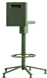
Matt colour Olive Green 1551 C