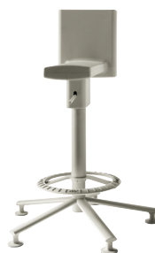
Matt colour Light Grey 1707 C