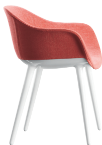
Frame: Glossy White 1736 C Seat + Back: Red F-124 (542)