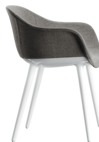
Frame: Glossy White 1736 C Seat + Back: Grey F-508 (182)