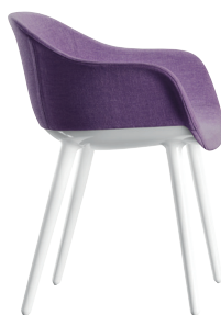
Frame: Glossy White 1736 C Seat + Back: Purple F-482 (562)