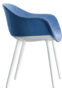
Frame: Glossy White 1736 C Seat + Back: Light Blue F-223 (752)