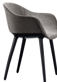
Frame: Glossy Black 1763 C Seat + Back: Grey F-508 (182)