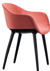
Frame: Glossy Black 1763 C Seat + Back: Red F-124 (542)