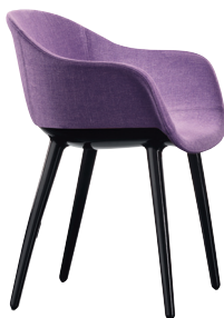
Frame: Glossy Black 1763 C Seat + Back: Purple F-482 (562)