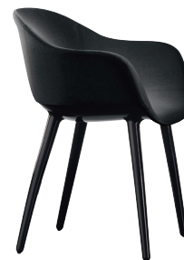
Frame: Glossy Black 1763 C Seat + Back: Black L-0795 leather