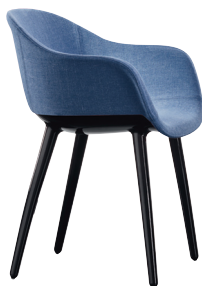
Frame: Glossy Black 1763 C Seat + Back: Light Blue F-223 (752)