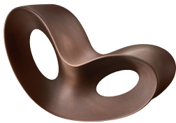
Outdoor use Matt colour: Rust Brown 1069 C