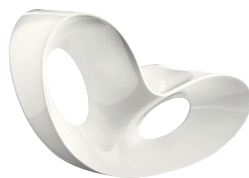
Indoor use Glossy colour: White 1736 C