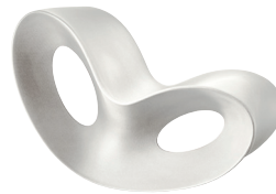
Outdoor use Matt colour: White 1736 C