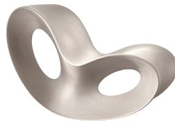
Outdoor use Matt colour: Light Grey 1395 C