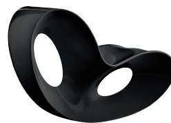
Indoor use Glossy colour: Black 1763 C