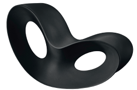
Outdoor use Matt colour: Black 1763 C