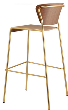
2854 OS NC

Seduta e schienale in multistrato di faggio. Struttura a 4 gambe in acciaio tubolare ø mm 16. Impilabile. Per uso interno.