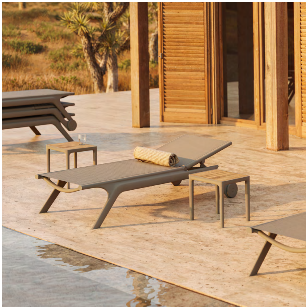
P. 84 – 85 AFRICA sun lounge. Tortora and tortora Sun lounge table. Tortora and synthetic wood