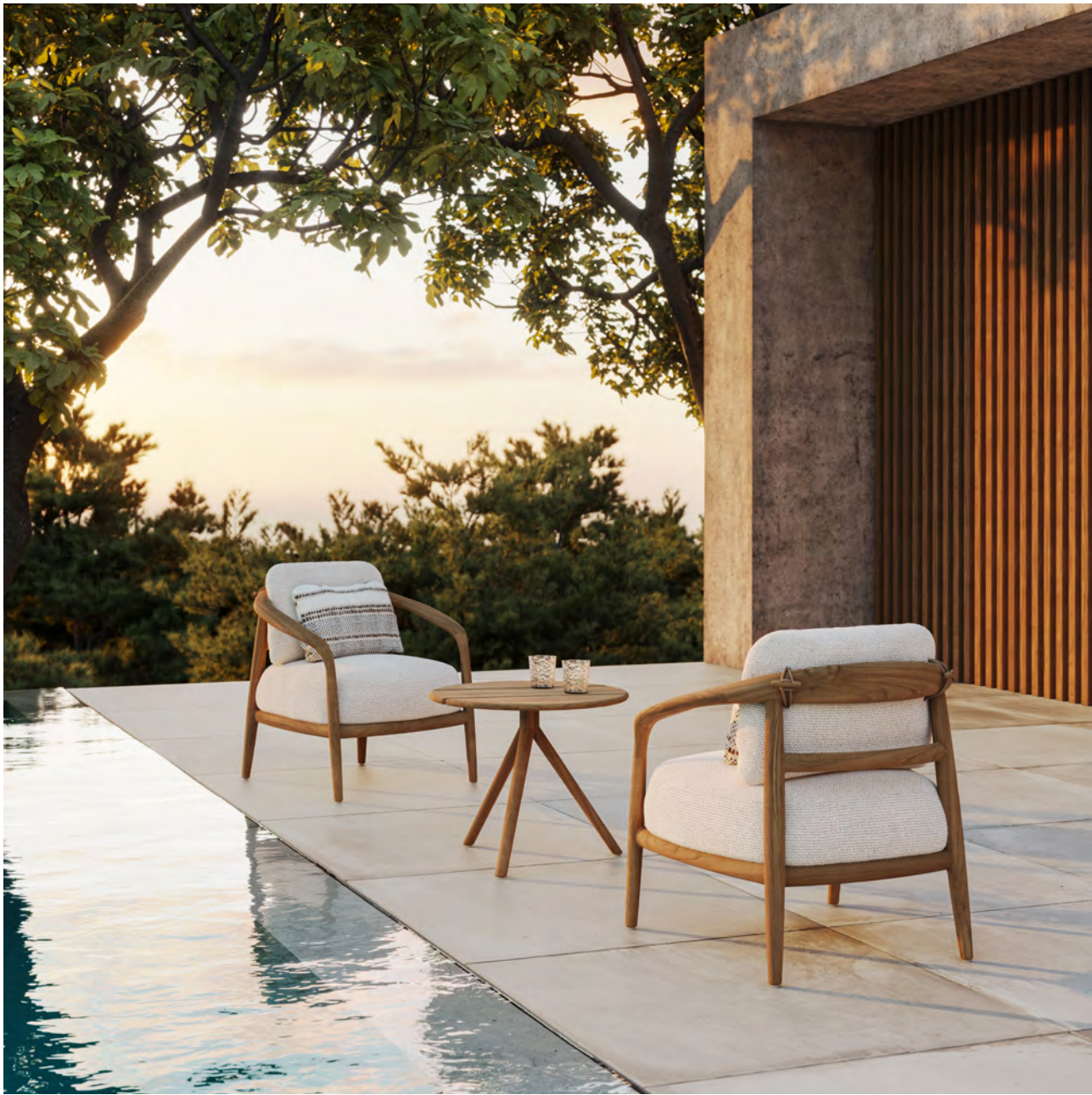
FUSTA low armchair. Teak wood and louro cream.