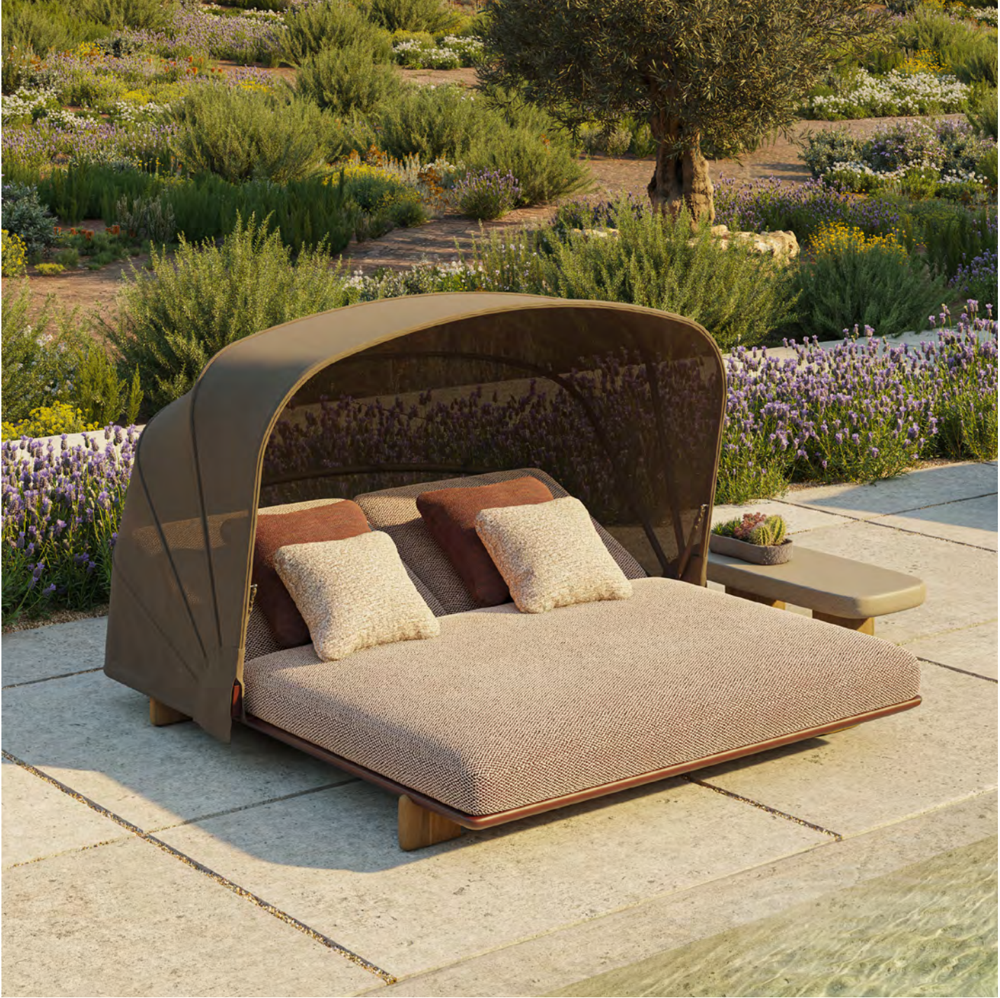
MILOS daybed with sunroof. Teak wood, garnet, louro garnet and roof fabric brown SUAVE cushions. Roses garnet and ribadeo garnet