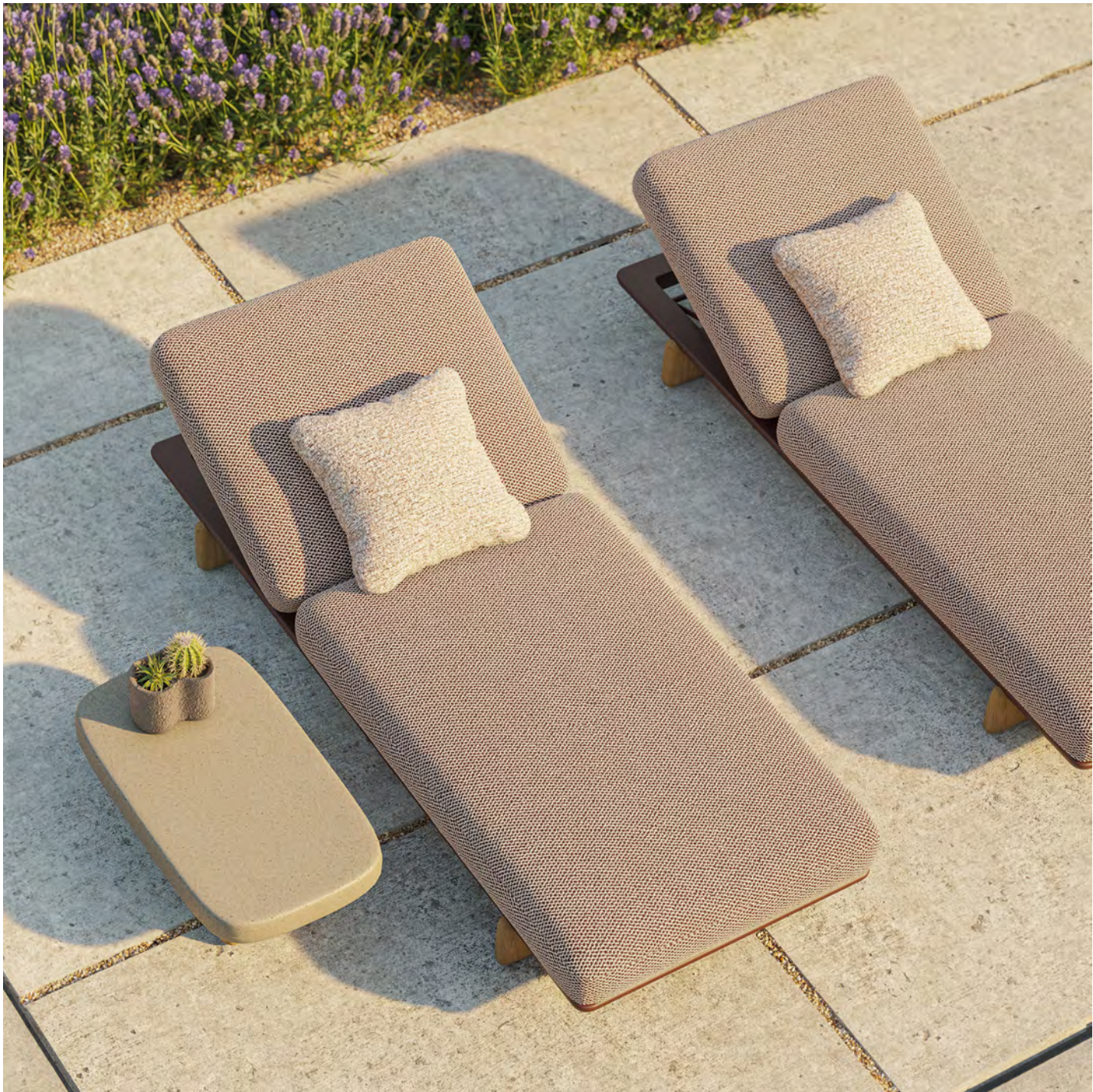
MILOS sun lounger. Teak wood, garnet and louro garnet

Coffee table. Teak wood and concrete tortora