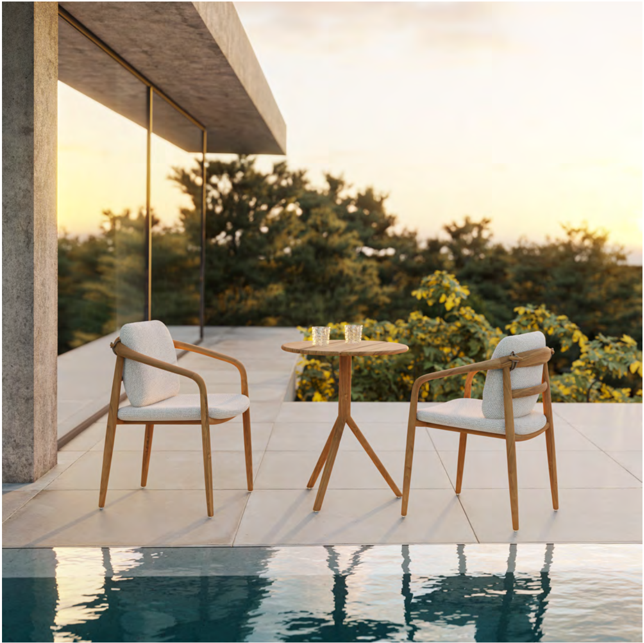
Table. Teak wood