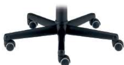
APN 5 star base with steel inner frame 25x30 mm th.2 mm Ø 670 mm, cover in black polypropylene. (Ansi-Bifma X5.1-1993/8)