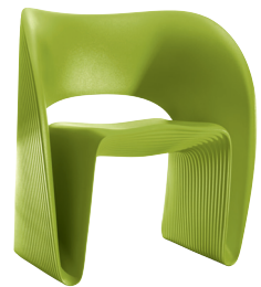
Matt colour Lime Green 1346 C