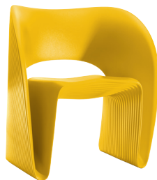
Matt colour Yellow 1665 C