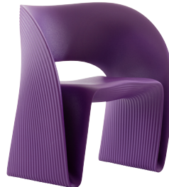
Matt colour Purple 1156 C