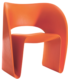
Matt colour Orange 1001 C