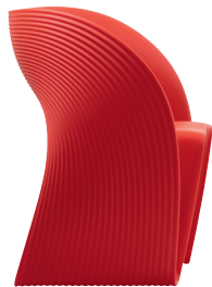
Matt colour Red 1004 C