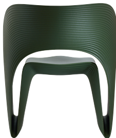
Matt colour Olive Green 1517 C