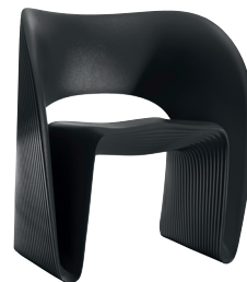
Matt colour Black 1754 C

Arm sideways static load test EN 15373:2007, L3 - severe Seat and back static load test EN 15373:2007, L3 - severe Leg forward static load test EN 15373:2007, L3 - severe Leg sideways static load test EN 15373:2007, L3 - severe Arm downwards static load test EN 15373:2007, L3 severe Arm fatigue test EN 15373:2007, L3 - severe Seat front edge fatigue test EN 15373:2007, L3 - severe Seat and back fatigue test EN 15373:2007, L3 - severe Non-domestic seating. Vertical load on back rest EN 15373:2007, L3 - severe Non-domestic seating. Information for use EN 15373:2007 Non-domestic seating. Safety requirements EN 15373:2007 Stability EN 1022:2005 Arm impact test EN 15373:2007, L3 - severe Seat impact test EN 15373:2007, L3 - severe Back impact test EN 15373:2007, L3 - severe