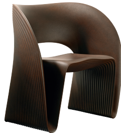
Matt colour Rust Brown 1069 C