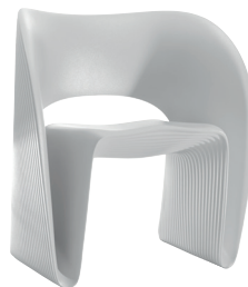
Matt colour White 1735 C