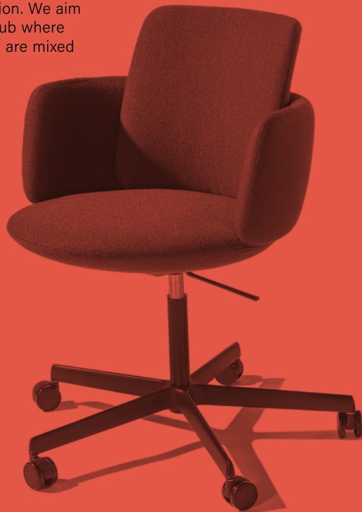
↗ Cuscini Work

Every visionary architectural project stems from essential design research: for us, it starts by building solid foundations to support the poetry of design. Our goal is to revitalize a brand with a rich product history. We are excited about this journey, starting with the new products you'll see here, our enlarged staff, and our new headquarters, which since January '24 has hosted all our resources and will hopefully shape our vision. We aim to create an inclusive hub where creativity and humanity are mixed to create products, relationships, and projects, defining the future poetry of maxdesign.