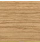
Lacquered ash 9 Colors