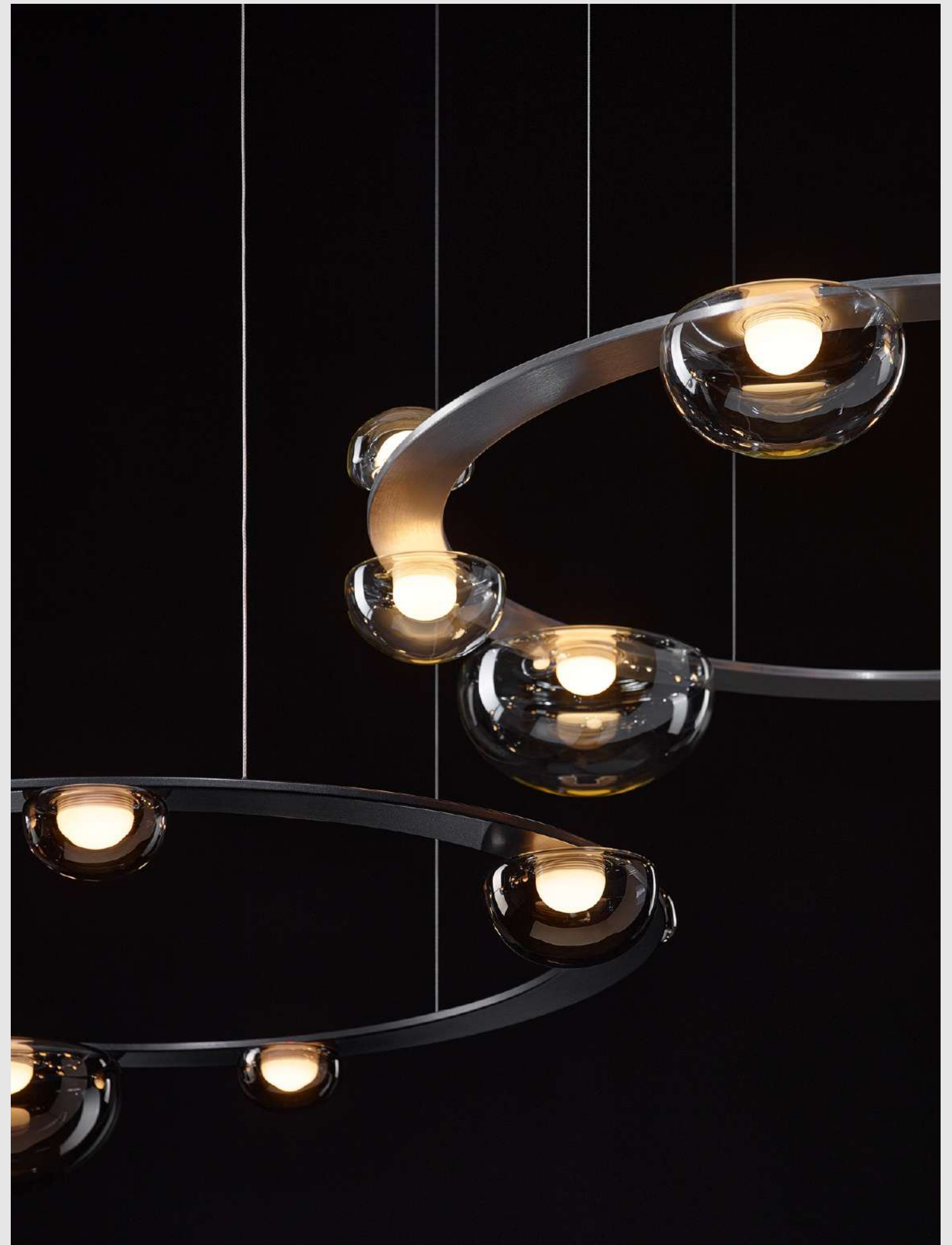
Dew Drops Circle | bomma