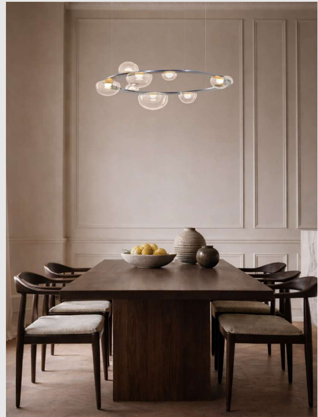
Dew Drops Circle | bomma