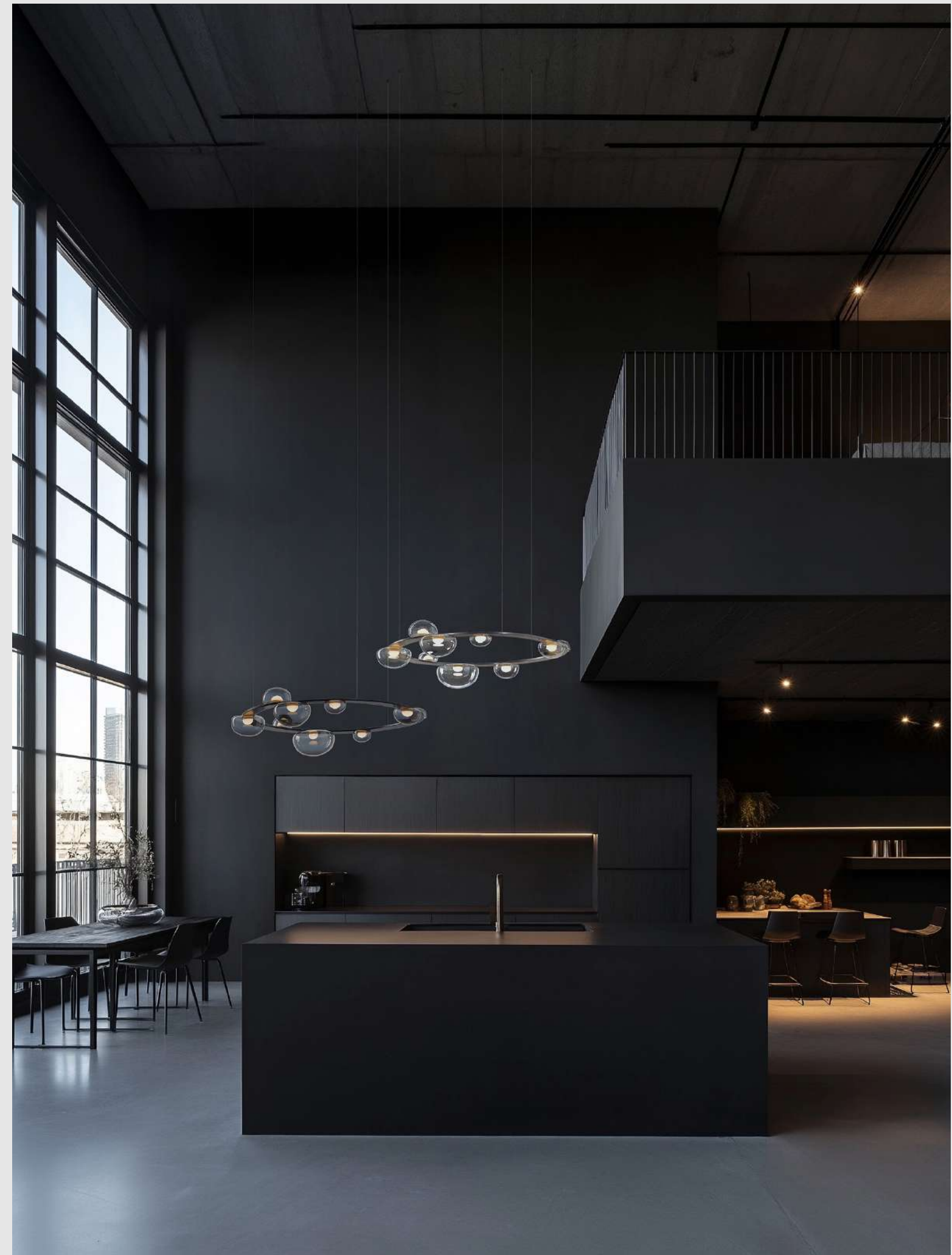
Dew Drops Circle | bomma