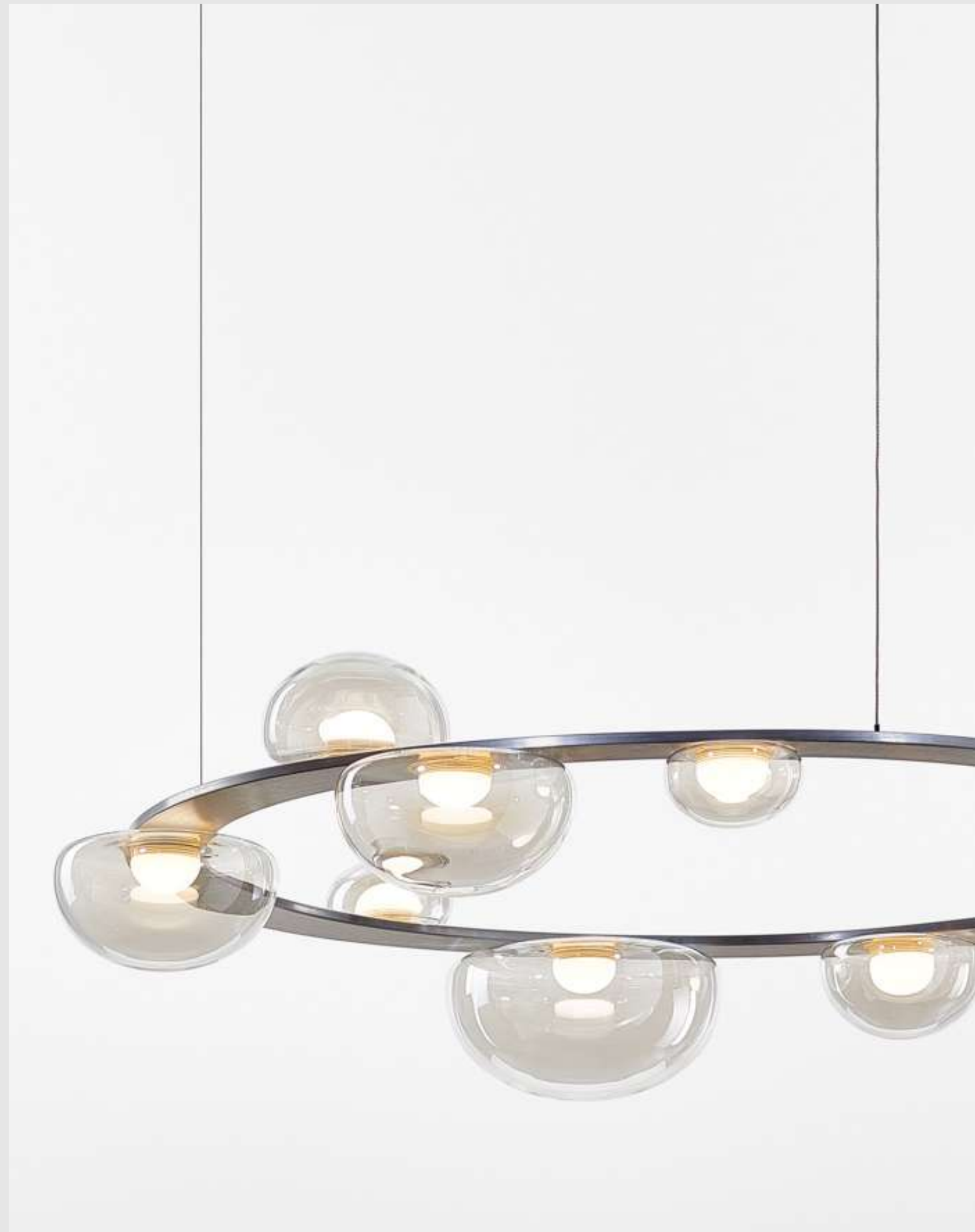
Dew Drops Circle | bomma