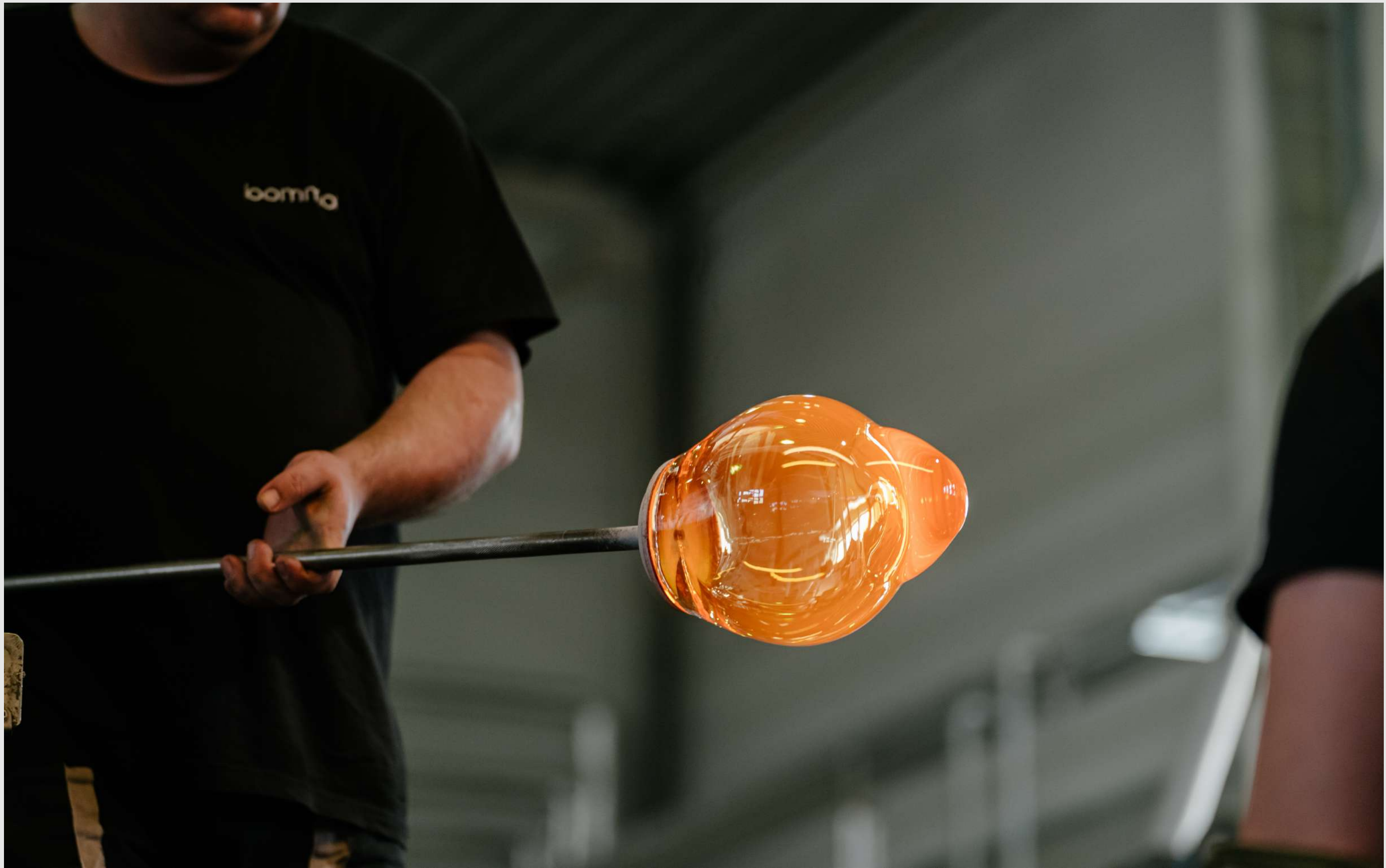
Dew Drops Circle bomma