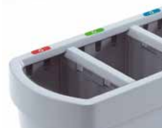
Example of use for labels code 429