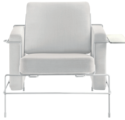
Frame: White 5011 Fabric: White F-737 Tablet: White Chaise longue and Platform not for outdoor