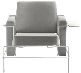
Frame: White 5011 Fabric: Light Grey F-741 (133) Tablet: White