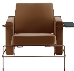
Frame: Sepia Brown 5016 Leather: Brown L-0111 Tablet: Anthracite Grey