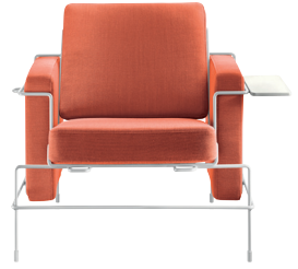
Frame: White 5011 Fabric: Orange F-088 (533) Tablet: White