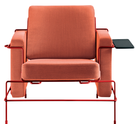
Frame: Signal Red 5019 Fabric: Orange F-088 (533) Tablet: Anthracite Grey

The Kvadrat colour numbers are indicated in brackets next to the Magis inner colour number. The information included in this product sheet are based on the last data in our current pricelist. Magis reserves the right to modify the products without notice.