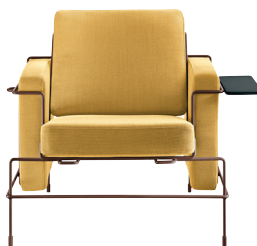
Frame: Sepia Brown 5016 Fabric: Yellow F-578 (453) Tablet: Anthracite Grey