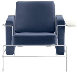
Frame: White 5011 Fabric: Blue F-257 Tablet: White Chaise longue and Platform not for outdoor