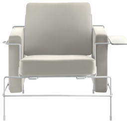
Frame: White 5011 Leather: Cream White L-0706 Tablet: White