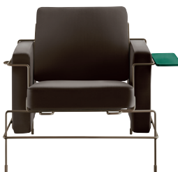
Frame: Mahogany Brown 5015 Leather: Dark Brown L-0752 Tablet: Dark Green