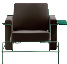
Frame: Dark Green 5021 Leather: Dark Brown L-0752 Tablet: Dark Green