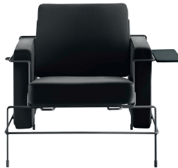
Frame: Black 5013 Leather: Anthracite Grey L-0060 Tablet: Anthracite Grey