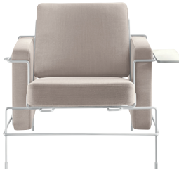
Frame: White 5011 Fabric: Beige F-266 (205) Tablet: White