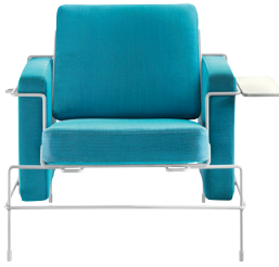
Frame: White 5011 Fabric: Turquoise F-227 Tablet: White Chaise longue and Platform not for outdoor