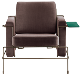
Frame: Mahogany Brown 5015 Fabric: Brown F-530 (353) Tablet: Dark Green