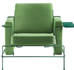
Frame: Dark Green 5021 Fabric: Green F-354 (953) Tablet: Dark Green