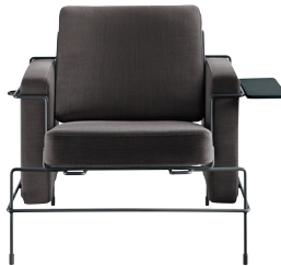
Frame: Black 5013 Fabric: Dark Brown F-521 (383) Tablet: Anthracite Grey