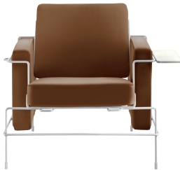
Frame: White 5011 Leather: Brown L-0111 Tablet: White