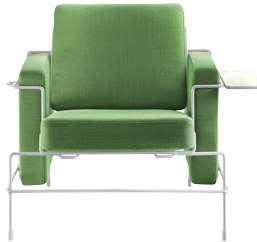
Frame: White 5011 Fabric: Green F-354 (953) Tablet: White