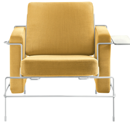
Frame: White 5011 Fabric: Yellow F-578 (453) Tablet: White