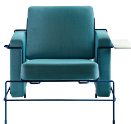
Frame: Green Blue 5017 Fabric: Light Blue F-222 (983) Tablet: White