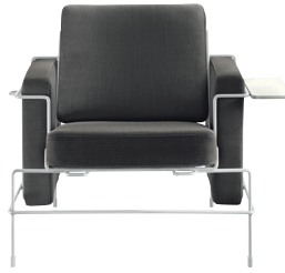
Frame: White 5011 Fabric: Black F-769 Tablet: White Chaise longue and Platform not for outdoor