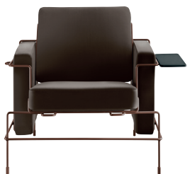
Frame: Sepia Brown 5016 Leather: Dark Brown L-0752 Tablet: Anthracite Grey