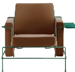
Frame: Dark Green 5021 Leather: Brown L-0111 Tablet: Dark Green