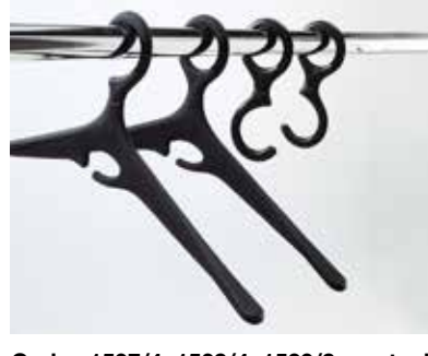
Codes 1537/4, 1538/4, 1529/8 on steel coat rail

Description: clothes hanger hook made in matt black polypropylene, with rounded edges. The hook has a closed ring at the top so it cannot be removed from the coat rail and a coat hook at the bottom. The hook neck is designed to house the token and soft token system. Accessories: token and soft token system code 1539