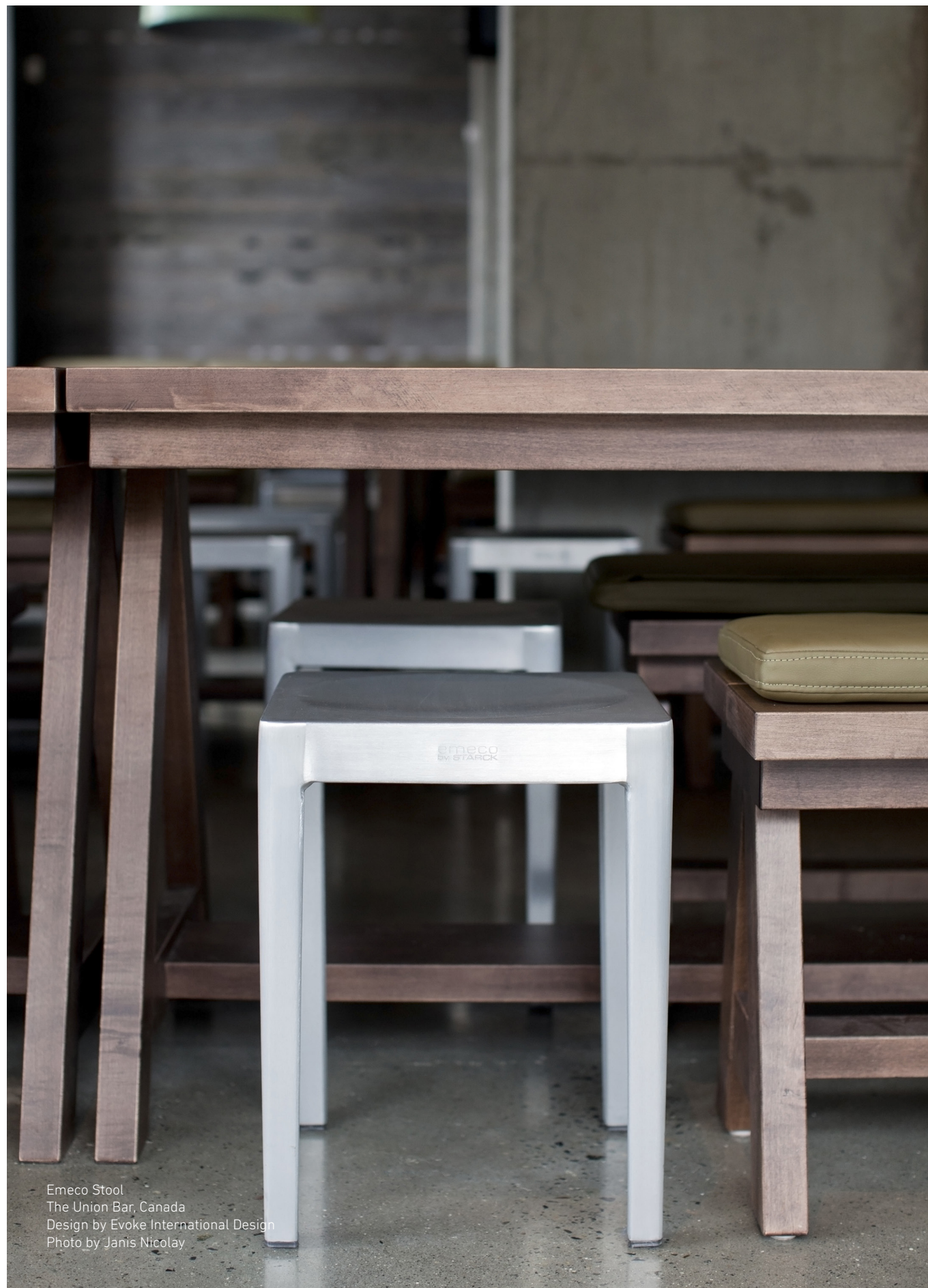
Emeco Stool The Union Bar, Canada Design by Evoke International Design