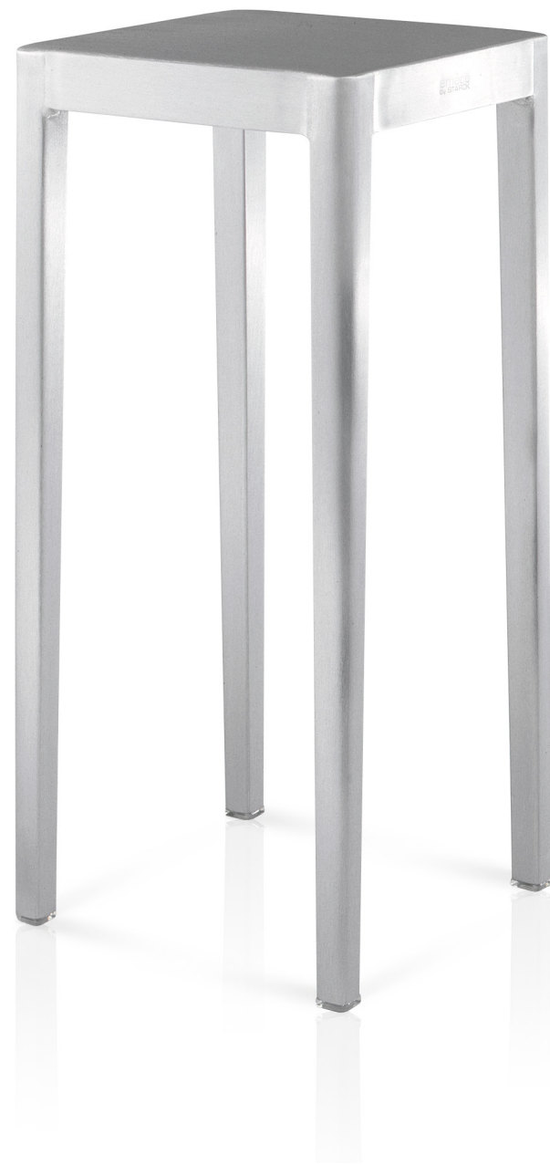
Emeco Occasional Table. Opposite page, left to right: Emeco Counter Stool, Emeco Barstool, Emeco Stool.