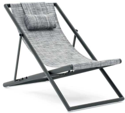
Sdraio pieghevole foldable Deckchair