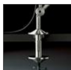
TOLOMEO MORSETTO A004100