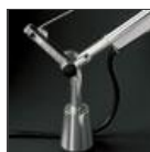
TOLOMEO SUPP.TAVOLO FISSO A004200