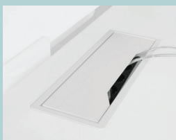
Metal grommet: 317x119, H=27 mm