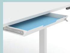
Felt-lined metal drawer with lock