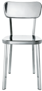
Indoor use Polished Aluminium