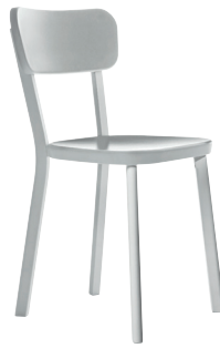
Outdoor use White 5110