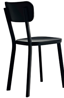
Outdoor use Black 5130