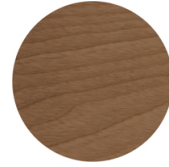
"Canaletto" walnut stained ash wood