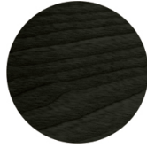
Black stained ash wood