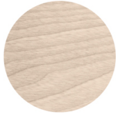
maple stained ash wood