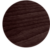
Wengé stained ash wood