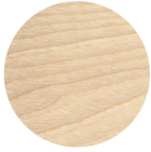
Natural ash wood