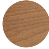
Oak stained ash wood