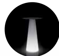
Versione light / Light version