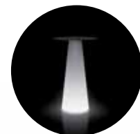
Versione light / Light version