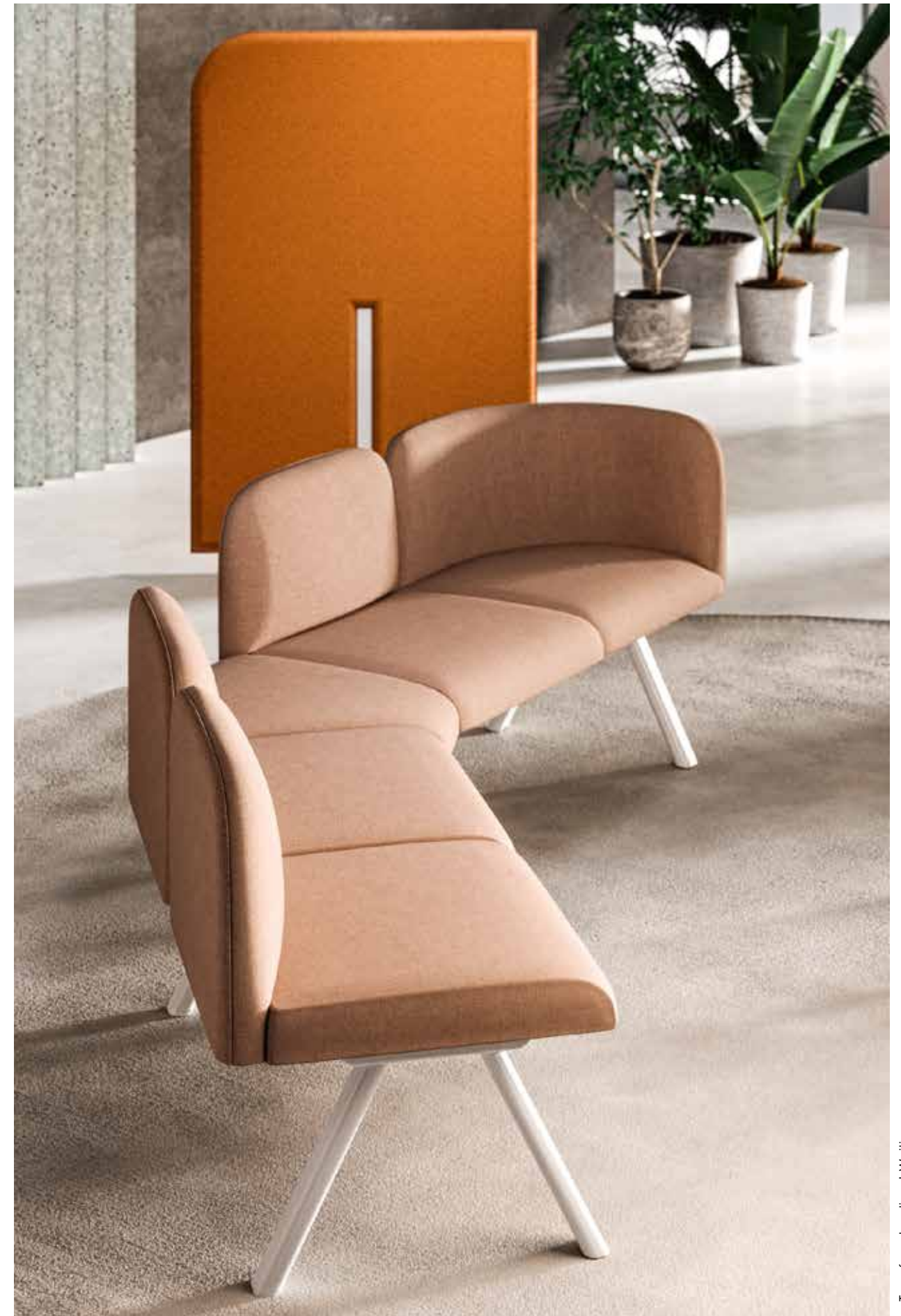
Tune free-standing | Waiting area

[IT] La staffa di fissaggio del pannello Piuma è regolabile per piani con spessore 10-30mm. [EN] Piuma bracket support is suitable for 10-30mm desk thickness.