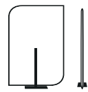
TUNE FREE-STANDING 100

0,125 m 3 - 15,5 kg 159x110x7 cm 1pc [carton]