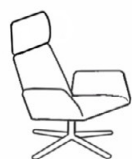
MA/1P/KL w_81 d_83 h_111 sh_41