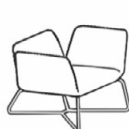
MA/1/L w_103 d_90 h_75 sh_44