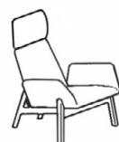
MA/1P/D w_81 d_83 h_111 sh_41