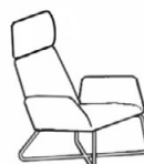
MA/1P/L w_81 d_83 h_111 sh_41