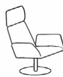
MA/1P/TL w_81 d_83 h_111 sh_41