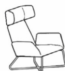
MA/1Z/L w_81 d_83 h_107 sh_41