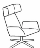
MA/1Z/KL w_81 d_83 h_107 sh_41