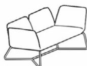
MA/2/L w_169 d_90 h_75 sh_44