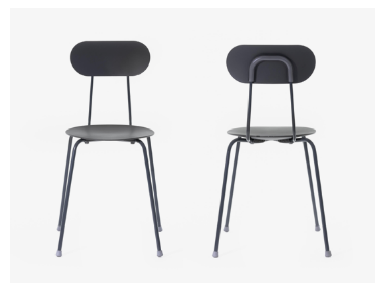
Mariolina in all Black