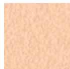
Facepowder pink metal