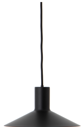
Matt black: art.no. 108372

Instagram ready images. The correct format for Instagram images can be downloaded here .