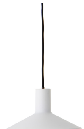
Matt white: art.no. 108373