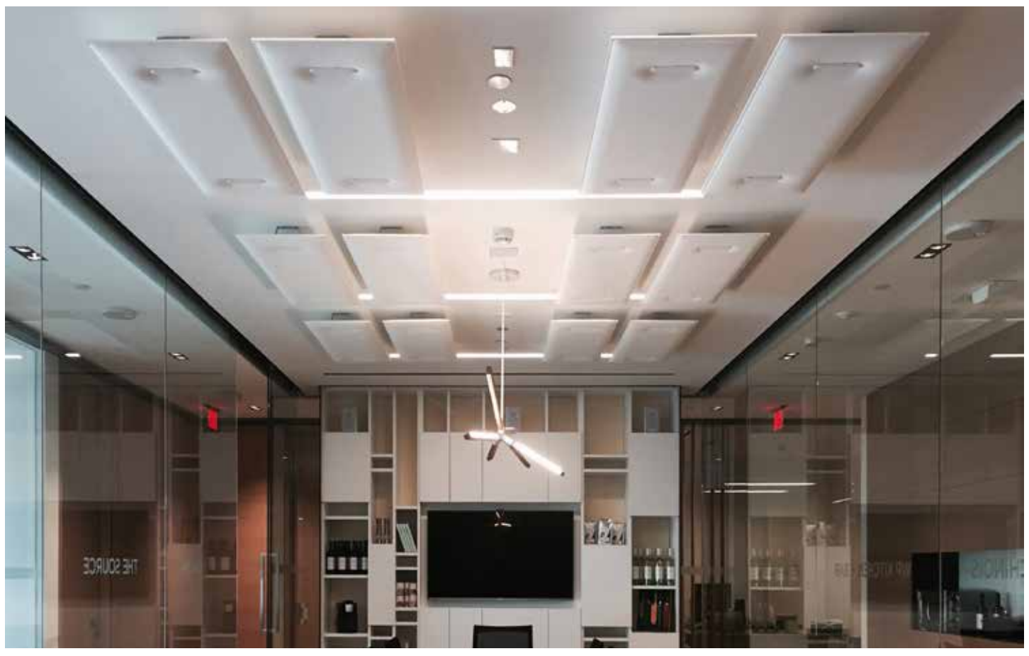
Caimi Brevetti S.p.A. reserves, by its unappealable judgment, the right to modify without prior notice the building materials, the technical and aesthetic specifications, as well as the dimensions of the products in this technical sheet, where pictures are purely as an indication.