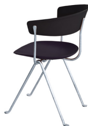
Frame: Galvanized Seat and Back: Black Leather L-0060