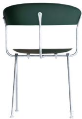
Frame: Galvanized Seat and Back: Dark Green 1555 C