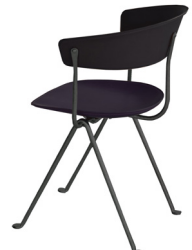
Frame: Black Seat and Back: Black Leather L-0060