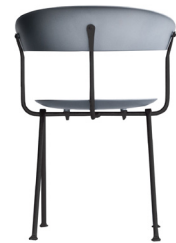
Frame: Black Seat and Back: Metallised Grey 1761 C