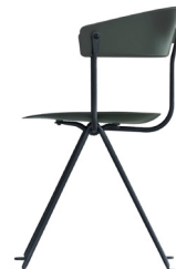
Frame: Black Seat and Back: Dark Green 1555 C