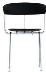
Frame: Galvanized Seat and Back: Black 1763 C