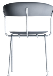
Frame: Galvanized Seat and Back: Metallised Grey 1761 C