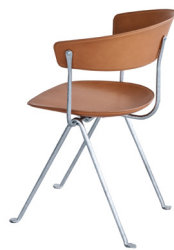
Frame: Galvanized Seat and Back: Natural Leather L-0090