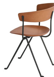
Frame: Black Seat and Back: Natural Leather L-0090