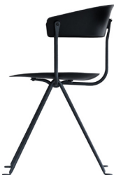
Frame: Black Seat and Back: Black 1763 C