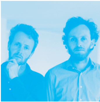
Ronan & Erwan Bouroullec

Ronan and Erwan Bouroullec have been working together for about ten years now. Their collaboration is a permanent dialogue, nourished by their distinct personalities and a shared notion of diligence, with the intention to achieve greater balance and refinement. The Bouroullecs have been working with Magis since 2004, designing two complete furniture collections as well as other projects. These days, Ronan and Erwan Bouroullec design for numerous manufacturers and they also continue to carry out their own experimental activity which is essential to the development of their work at Galerie Kreo, Paris, where four exhibitions of their designs