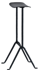
Frame: Black Seat and Back: Black 1763 C