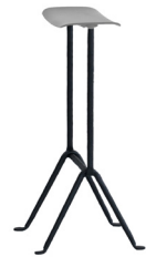
Frame: Black Seat and Back: Metallised Grey 1761 C