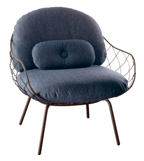
Frame: Brown 5074 Cushion: Brown-Blue F-531