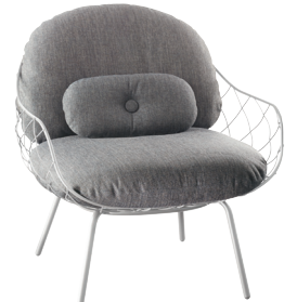
Frame: White 5108 Cushion: Grey Mélange