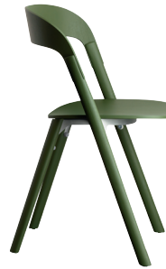
Colour Ash painted Green Joining element: Sanded