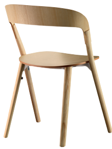
Colour Natural Ash Joining element: Sanded