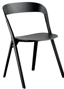
Colour Ash painted Black Joining element: Black