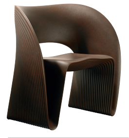
Matt colour Rust Brown 1069 C