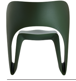
Matt colour Olive Green 1517 C

Seat impact test EN 15373:2007, L3 - severe Back impact test EN 15373:2007, L3 - severe