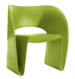
Matt colour Lime Green 1346 C