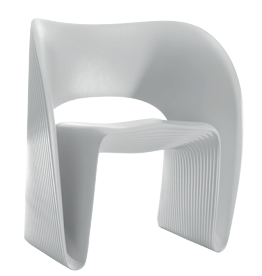
Matt colour White 1735 C