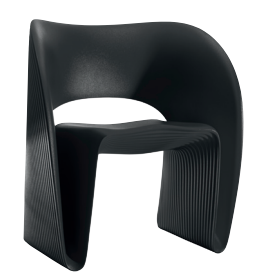
Matt colour Black 1754 C