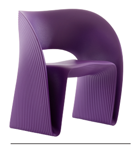
Matt colour Purple 1156 C