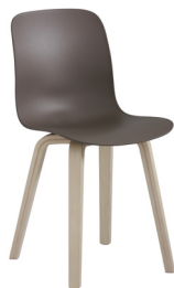
Frame: Natural Ash Seat: Beige 1452 C