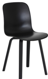
Frame: Ash painted black Seat: Black L-0060