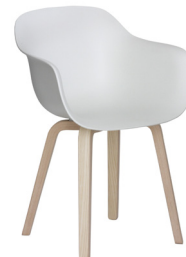
Frame: Natural Ash Seat: White 1735 C