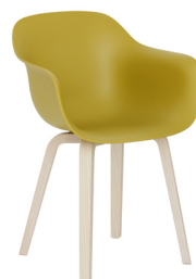
Frame: Natural Ash Seat: Mustard 1015 C