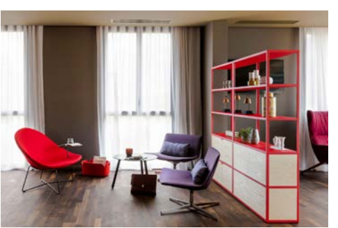
Okko Hotel Paris (Paris, France)