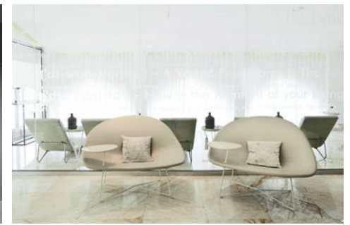
Limegrove Spa & Fitness (Limassol, Cyprus)