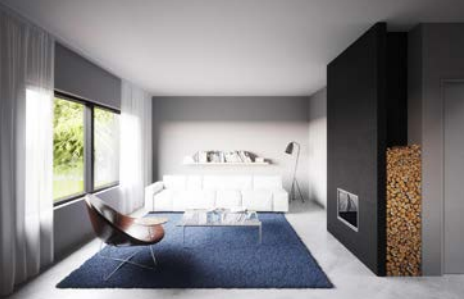
Tind House (Fiskarhedenvillan, Norway)