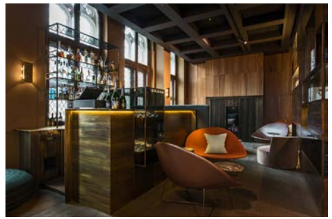
The Fourth, Tafelrond Hotel (Leuven, Belgium)