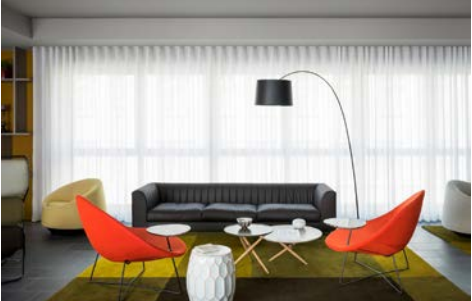
Okko Hotel Grenoble (Grenoble, France)