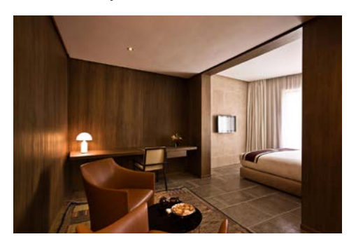
Riad Hotel (Fez, Morocco)