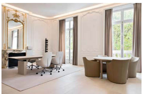
Bretueil (Paris, Fran