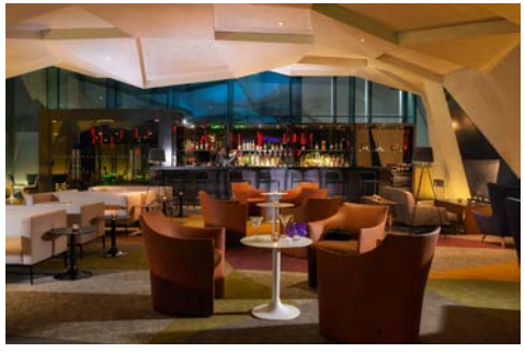
The Marker Hotel (Dublin, Ireland)