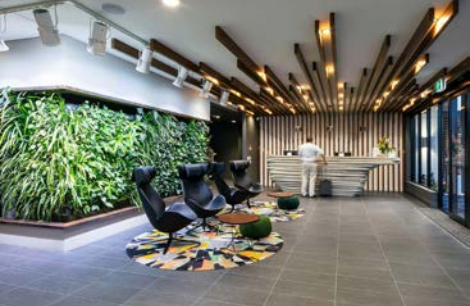
Richmont Hotel (Brisbane, Australia)