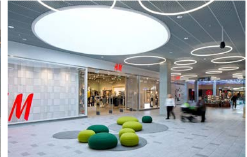
Turzyn Shopping Mall (Szczecin, Poland)