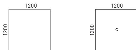
Height adjustable meeting tables with concrete base