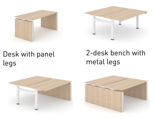
2-desk bench with one open metal leg panel legs

Desk height: 700-1200 mm (2), 650 -1300 mm (3)