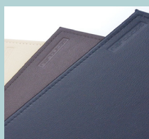
Leather table mats