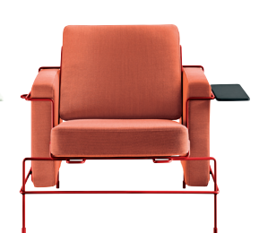
Frame: Signal Red 5019 Fabric: Orange F-088 (533) Tablet: Anthracite Grey