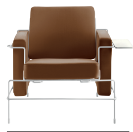
Frame: White 5011 Leather: Brown L-0111 Tablet: White