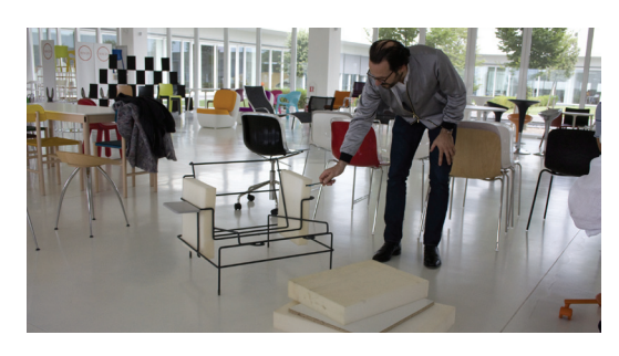
Designer in Magis

sofa, a bench in two versions, a chaise longue and an island. The collection has expanded further to include two low tables, one large, one small, and a high table, again with a metal rod frame, but with a top in artificial stone, adding another tactile sensation to the home and contract scenario.