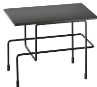
Indoor use Frame: Black 5013 Top: Anthracite Grey