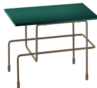
Indoor use Frame: Mahogany Brown 5015 Top: Green