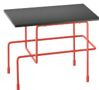
Indoor use Frame: Signal Red 5019 Top: Anthracite Grey