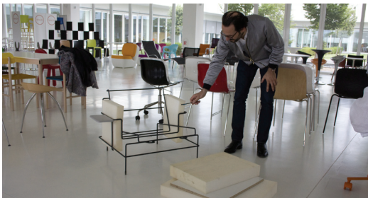
Designer in Magis

sofa, a bench in two versions, a chaise longue and an island. The collection has expanded further to include two low tables, one large, one small, and a high table, again with a metal rod frame, but with a top in artificial stone, adding another tactile sensation to the home and contract scenario.