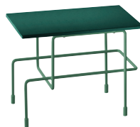
Indoor use Frame: Dark Green 5021 Top: Green