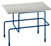
Indoor use Frame: Green Blue 5017 Top: White