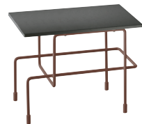
Indoor use Frame: Sepia Brown 5016 Top: Anthracite Grey