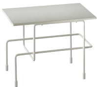
Outdoor use Frame: White 5011 Top: White Cataphoretically-treated version